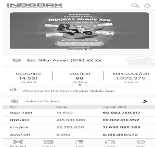
Figure 1. Indodax Application Display

alternative to fiat currencies, keeping companies and individuals accountable and giving users complete control over their assets. This makes users expect the best quality to be provided by the trading service provider from its user's [2]. Service quality is an effort to fulfill customer needs and desires and the accuracy of delivery to balance customer expectations; this can be known by comparing consumers' perceptions of the services they receive with the services they expect against the service attributes of a company. If the service received or perceived is as expected, then the service quality is perceived to be good and satisfactory, and vice versa; if the service received is lower than expected, the service quality is perceived to be poor [19]. Furthermore, service quality is also part of the quality of interaction, information, and internet-based services, which aim to strengthen the relationship between service users and organizations to increase their trust in the platform provided by the organization [1].