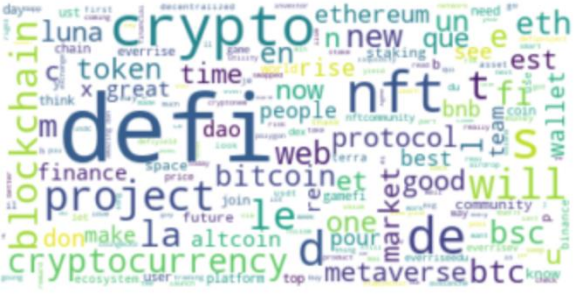
Figure 4. Wordcloud DeFi 30 April 2022 to 31 May 2022

Figure 3, figure 4, and Table 5 explain that there is no corelation between security incident in May ($ 300,191,300,000 loss) and DeFi sentiment. Wordcloud of unique tweet data in 30 April 2022 to 31 May 2022 not showing word of fraud, scam, bankrupt, or death.